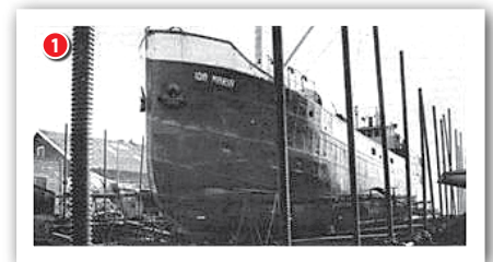
1 The Barbados Screwdock with maximum vessel in the early 20th century

Actual construction took far longer than the two years allowed. One of the reasons given was the flooding of the works by exceptionally high tides. Because the retaining walls had not yet been completed, portions of the embankments collapsed into the works.