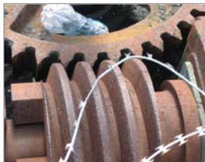
▶ New worm and worn wheel