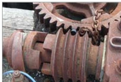
▶ New worm and wheel