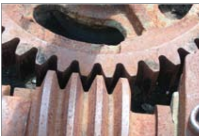
▶ Worn worm and new wheel